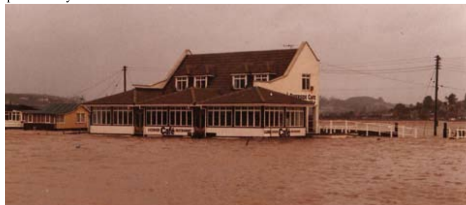
The Riverside surviving the floods in the 80s!