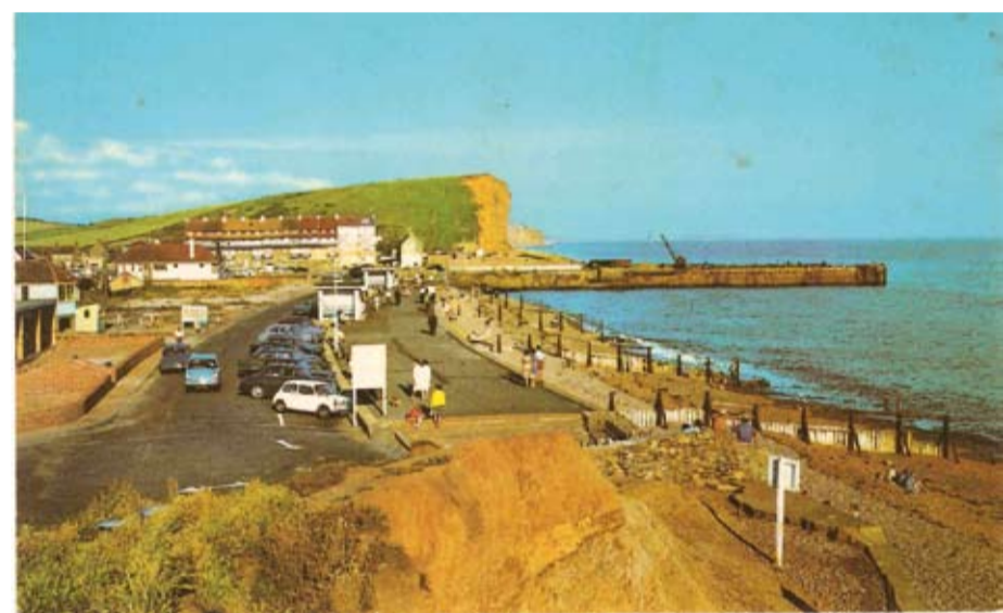
West Bay in 1964