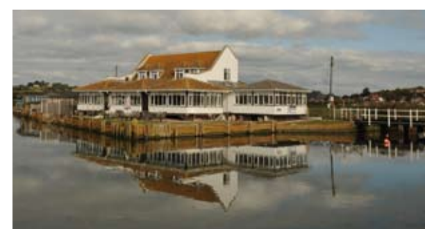
2009 (with new dining extension)

2005 Photo taken by George Wright for 'Dorset Man', a book written by local author, James Crowden.